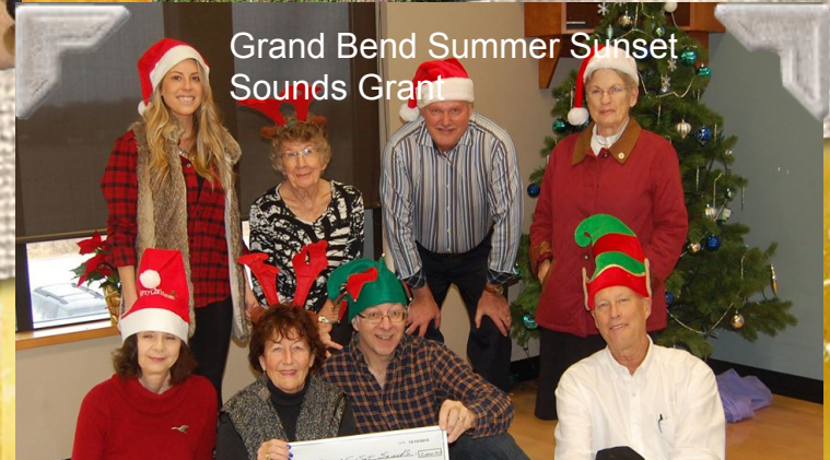
Grand Bend Summer Sunset Sounds Grant