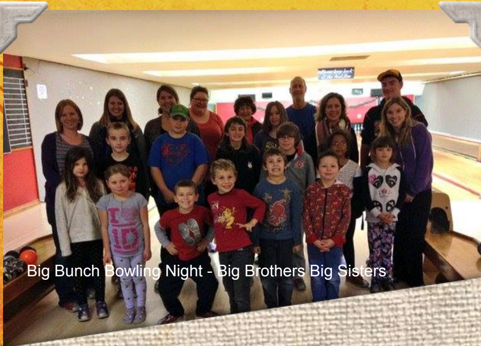
Big Bunch Bowling Night - Big Brothers Big Sisters