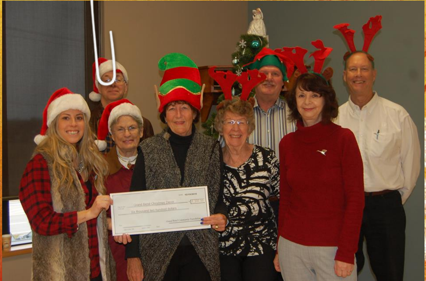
Photo: Grant Grand Bend Christmas Decor project.

Board Members, Volunteers, Community Members and Donors