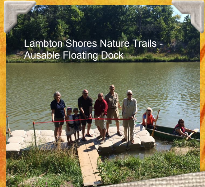
Lambton Shores Nature Trails - Ausable Floating Dock